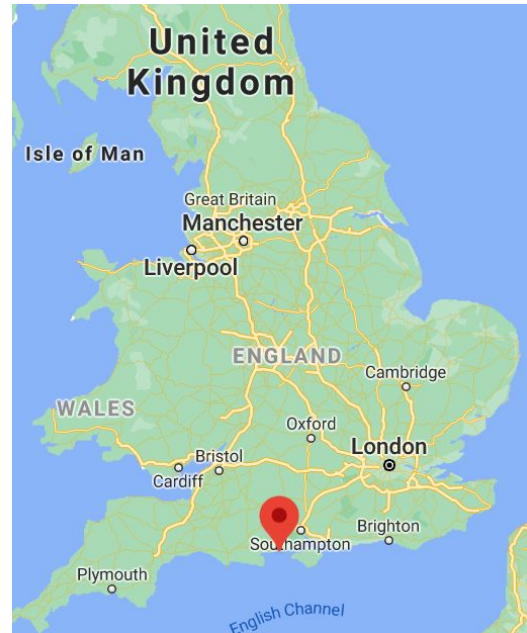
Christchurch Bay's Location.

Changes in the coastal landscape can be attributed to both physical and human processes interacting with the landscape and each other.