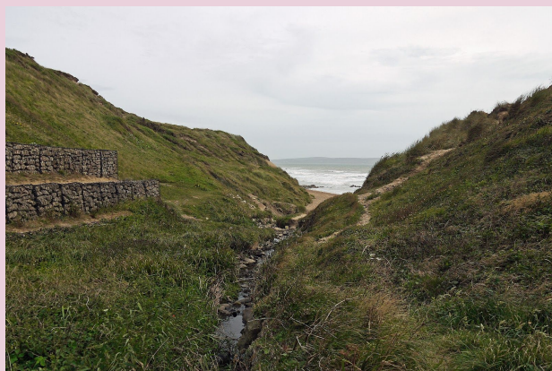
Becton Bunny, a famous chine in the area.

The rivers usually infiltrate and flow through the permeable rock by the time they reach the coast, which adds a lot of water to the cliffs and can cause instability, as well as erosion.