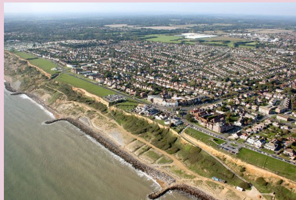
Barton-on-Sea (Groyne visible on coast).

Residential and industrial developments have created impermeable surfaces further inland (from concrete etc.) and altered the natural drainage system of the coastal area. More water is drained directly into the coastal cliffs rather than into soil water and groundwater stores inland.